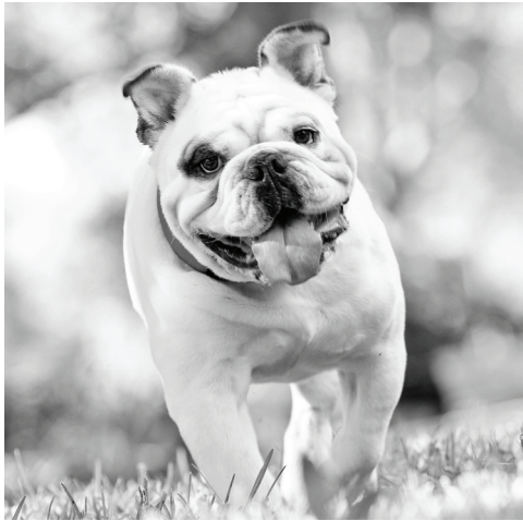
Beauregard V - Navarro College's mascot